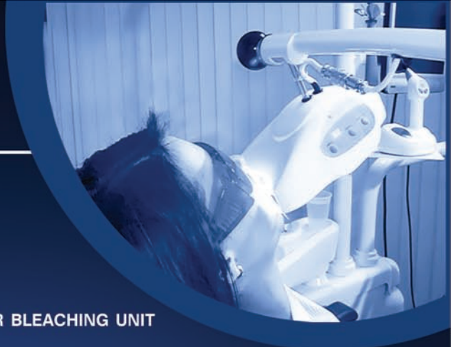
POWER BLEACHING UNIT